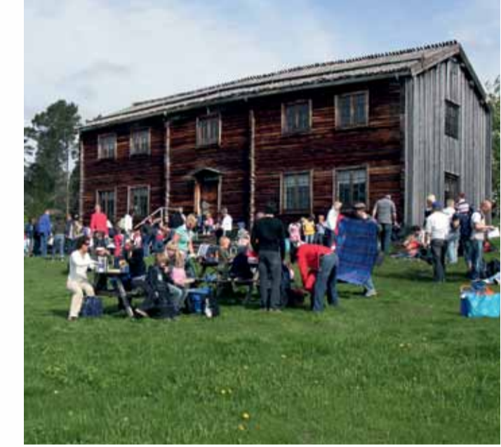
Myckelgensjö, Örnsköldsvik.

Look out! Keep your eyes peeled when travelling along the Sagavägen Road, as the region is not only inhabited by humans: there are elves, trolls and other spirits dwelling in the forests and mountains. The road will take you through communities that all have mystical tales derived from traditional Swedish, Norwegian or Sami folklore about mythical creatures.