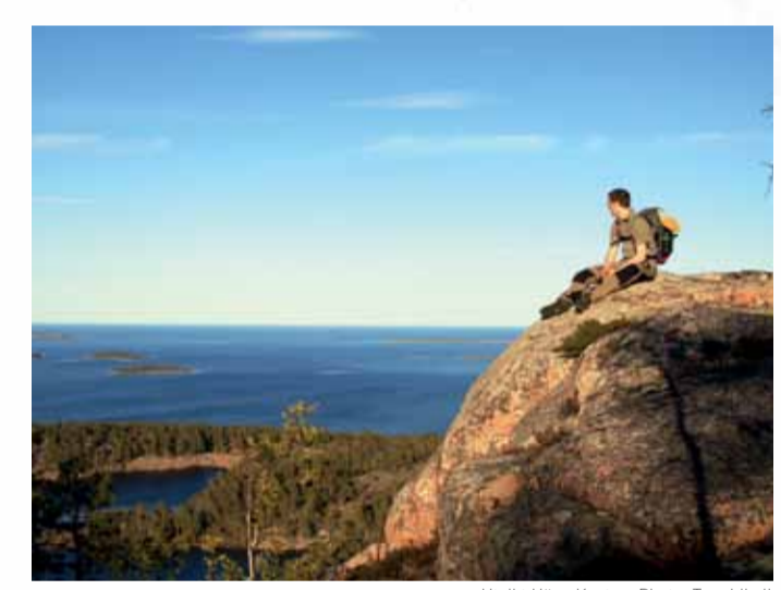
Utsikt Høga Kusten.

Vegaøyan – the Vega Archipelago The remarkable co-existence between Eider ducks and humans during the birds' breeding season led to the Vega islands being declared a World Heritage Site in 2004 and the archipelago continues to bear testimony to the sustainable methods of fishing and farming that have maintained the ecological balance for over 1,500 years.