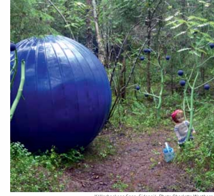
Källbackens Saga, Sidensjö.

FRA KYST SAGAVÄGEN TILL KUST From Coast to Coast