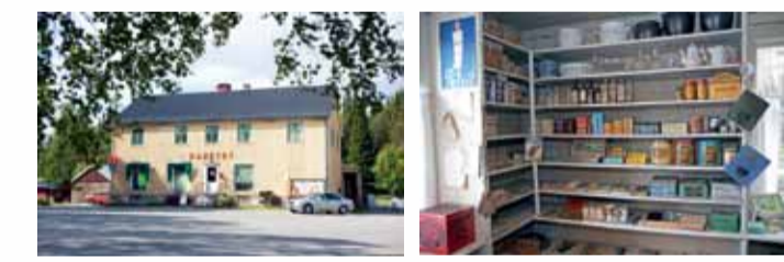
Unique shops along the road, Hammrebyns in Dikanäs and Asplunda lanthandel in Tallsjö.

The name for the road Sagavägen came originally from the multitude of myths and legends that make up cultural heritage of the Helgeland coastal region. But closer study revealed a wealth of tales and folklore along the whole road providing a unique combination of stories and traditions from Lapland, Norway and Sweden. The road really is like a good story: no matter at which point you begin, the start raises your expectations and it holds your interest throughout before finishing dramatically.