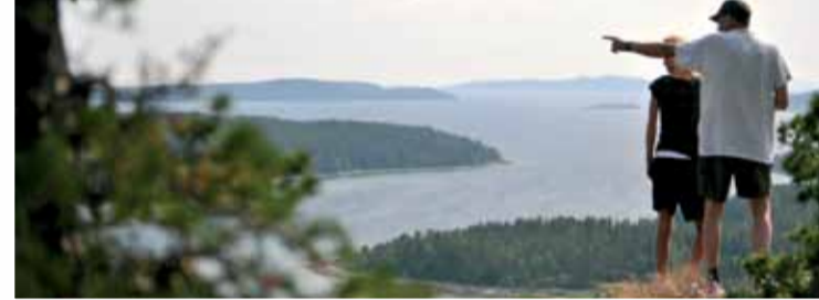
Mosjoen, • Boat at Bessvatnet, • Ulvohamn boats, • The spirit Näcken along the Saga trail at Kvarnbäcken, Rönnsås • • Cyclists, • View Høga Kusten