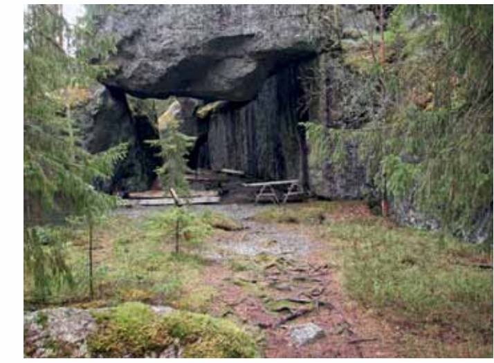
Vitterhuset - Vitter House, Photo: Sylve Holmgren.